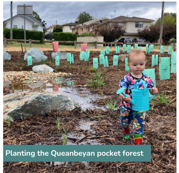
Planting the Queanbeyan pocket forest