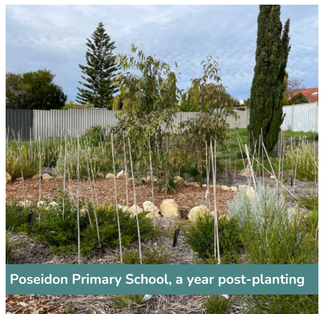
Poseidon Primary School, a year post-planting