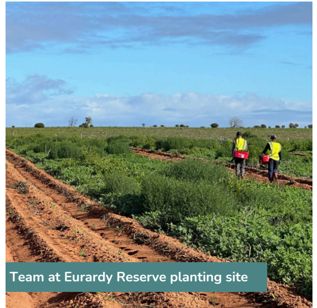
Team at Eurardy Reserve planting site